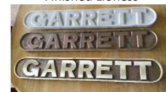
3 Stages of Garrett Production