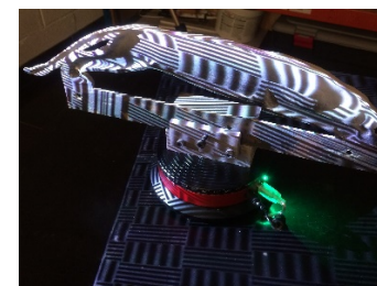
3D scanning of Lioness

Tel: 01356 308631 info@angus3dsolutions.co.uk www.angus3dsolutions.co.uk